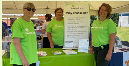
Peoples Community Health Center (FQHC)* in Waterloo