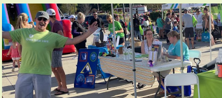
Primary Health Care (FQHC)* in Des Moines

Community Outreach takes our show on the road. August is the official month for appreciating Health Care Centers. At each unique healthcare event, we hosted a Resource Table. Here are three of the many places where we recently gave thanks and guidance.