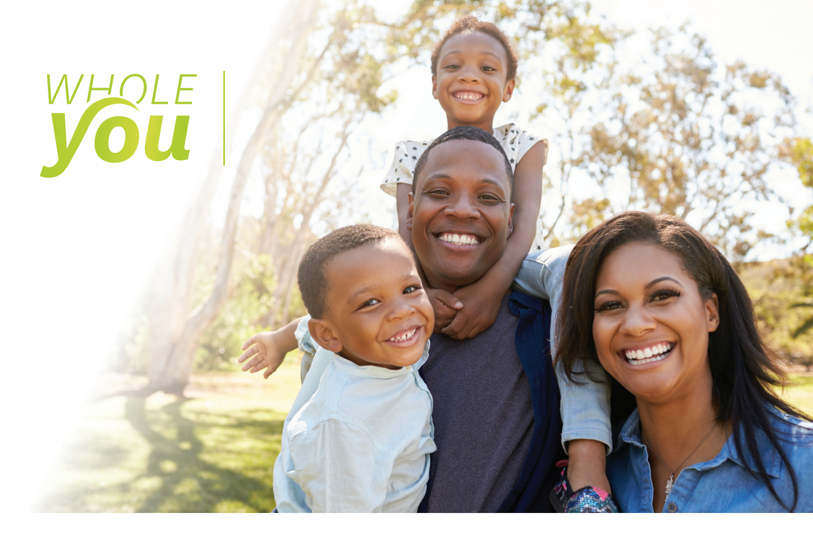
© 2021 Iowa Total Care. All rights reserved.

Iowa Total Care complies with applicable Federal civil rights laws and does not discriminate on the basis of race, color, national origin, age, disability, or sex. | Iowa Total Care cumple con las leyes federales de derechos civiles aplicables y no discrimina en base a la raza, el color, el país de origen, la edad, la discapacidad o el sexo.