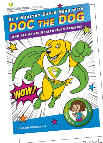
Super Hero Activity Booklet

Contact your territory representative to learn more about ITC's Read with Doc program.