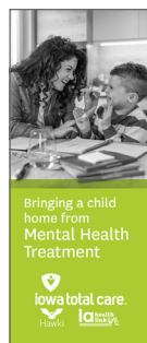
Pediatric Discharge Brochure & 1-Pager